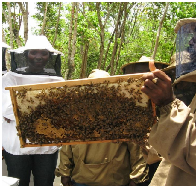
Trainees inspect honeycombs as part of a USAID-supported bee farming conservation enterprise project in Jamaica.