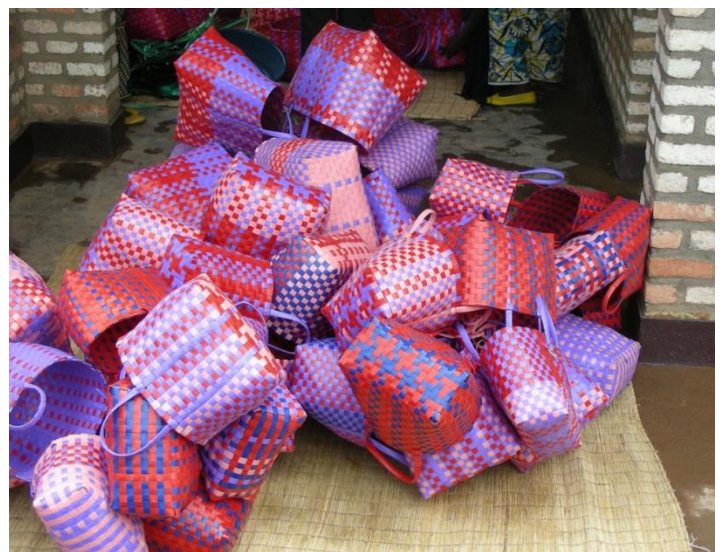
In Rwanda, colorful hand-woven baskets produced by women's association members wait for transport to market.