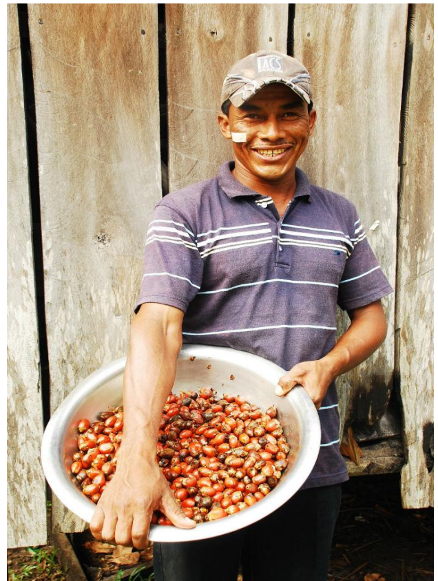
Conservation Enterprises project beneficiary in Mosquitia, Honduras shows off some of the Ojan nuts that he's cultivated.